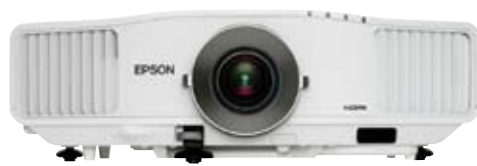
G5150NL and G5350NL Front