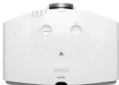
G5150NL and G5350NL Top